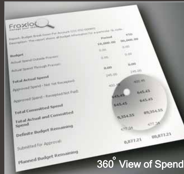
360° View of Spend

From a micro view, you can track detail down to how much an individual employee spends with a particular vendor. At an organisational level, if millions are being spent, this type of visibility has a profound impact on the bottom line.